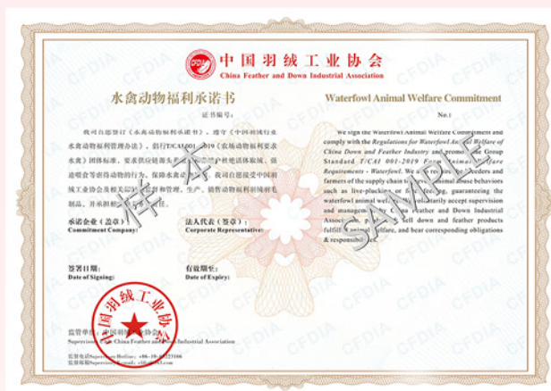
The Sample of Waterfowl Animal Welfare Commitment

With the publishing and implementation of T/CAI 001-2019 Farm Animal Welfare Requirements – Waterfowl , China down industry has put forward higher goals and requirements for waterfowl animal welfare. In order to promote the effective practice of waterfowl animal protection measures of down industry, since 1 st JAN 2021, China Feather and Down Industrial Association has organized to sign the Waterfowl Animal Welfare Commitment and implemented Regulations for Waterfowl Animal Welfare of China Down and Feather Industry. Based on the principles of effective practice, honesty, self-discipline, and openness & justice, CFDIA will establish two registration lists of committed down companies and animal welfare farms respectively, as the main body responsible for implementing commitments.